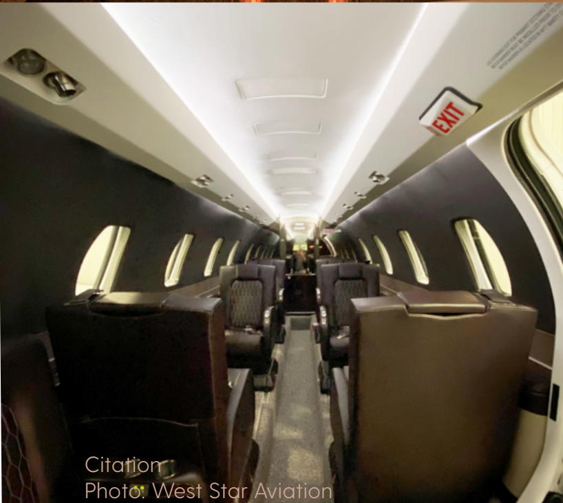
Citation Photo: West Star Aviation