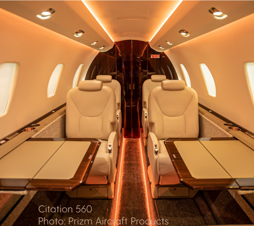
Citation 560