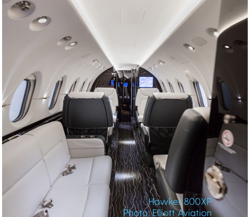
Hawker 800XP