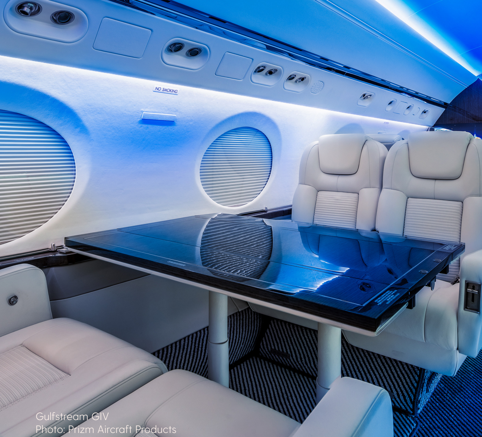
Gulfstream GIV