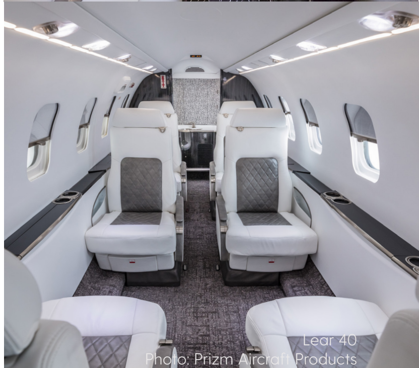
Lear 40