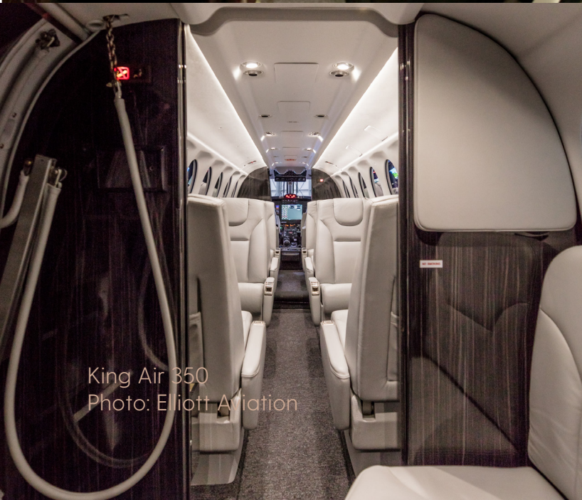
King Air 350