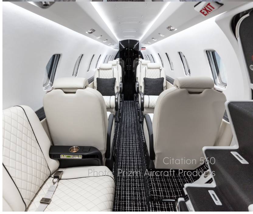
Citation 560