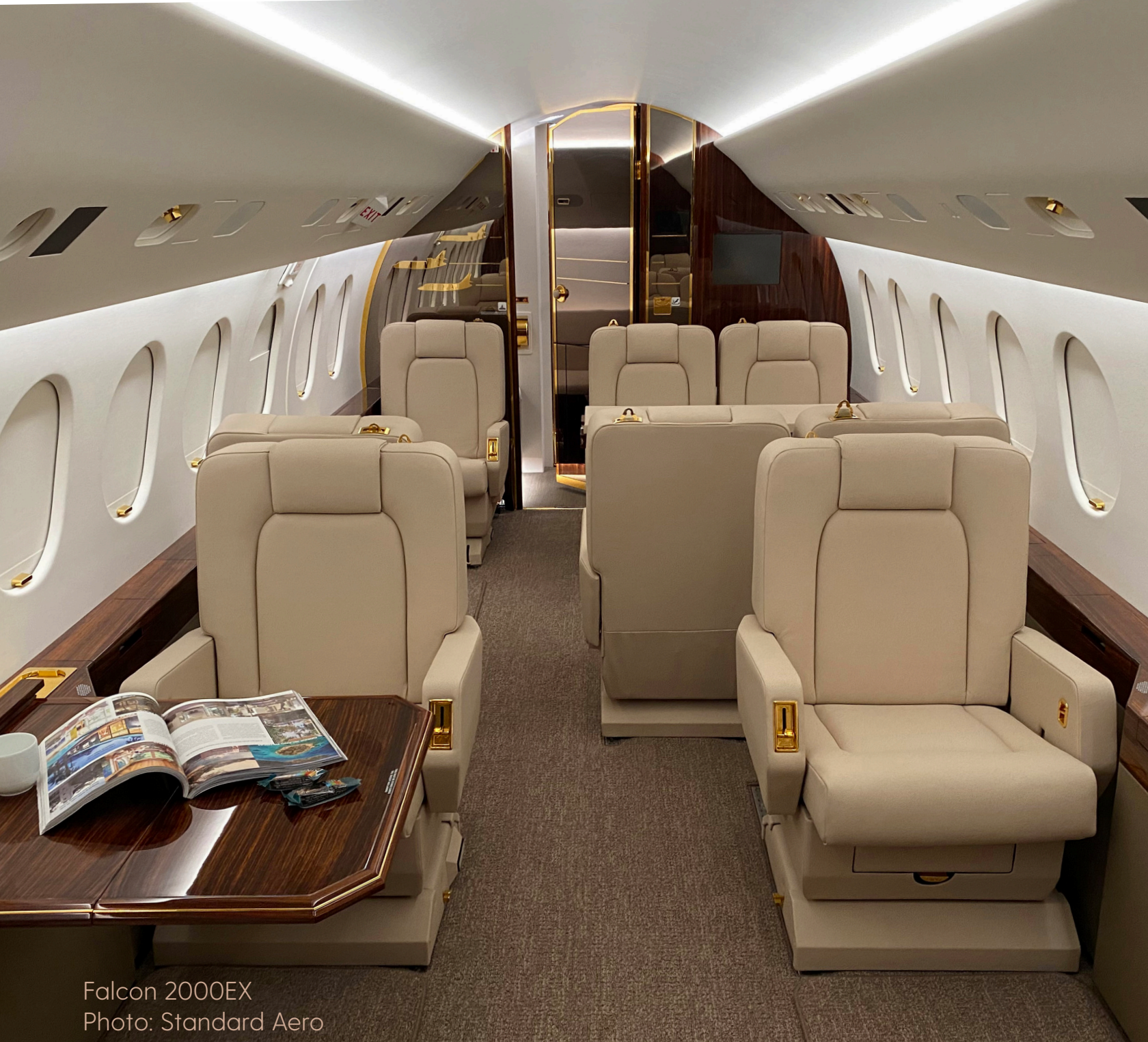
Falcon 2000EX