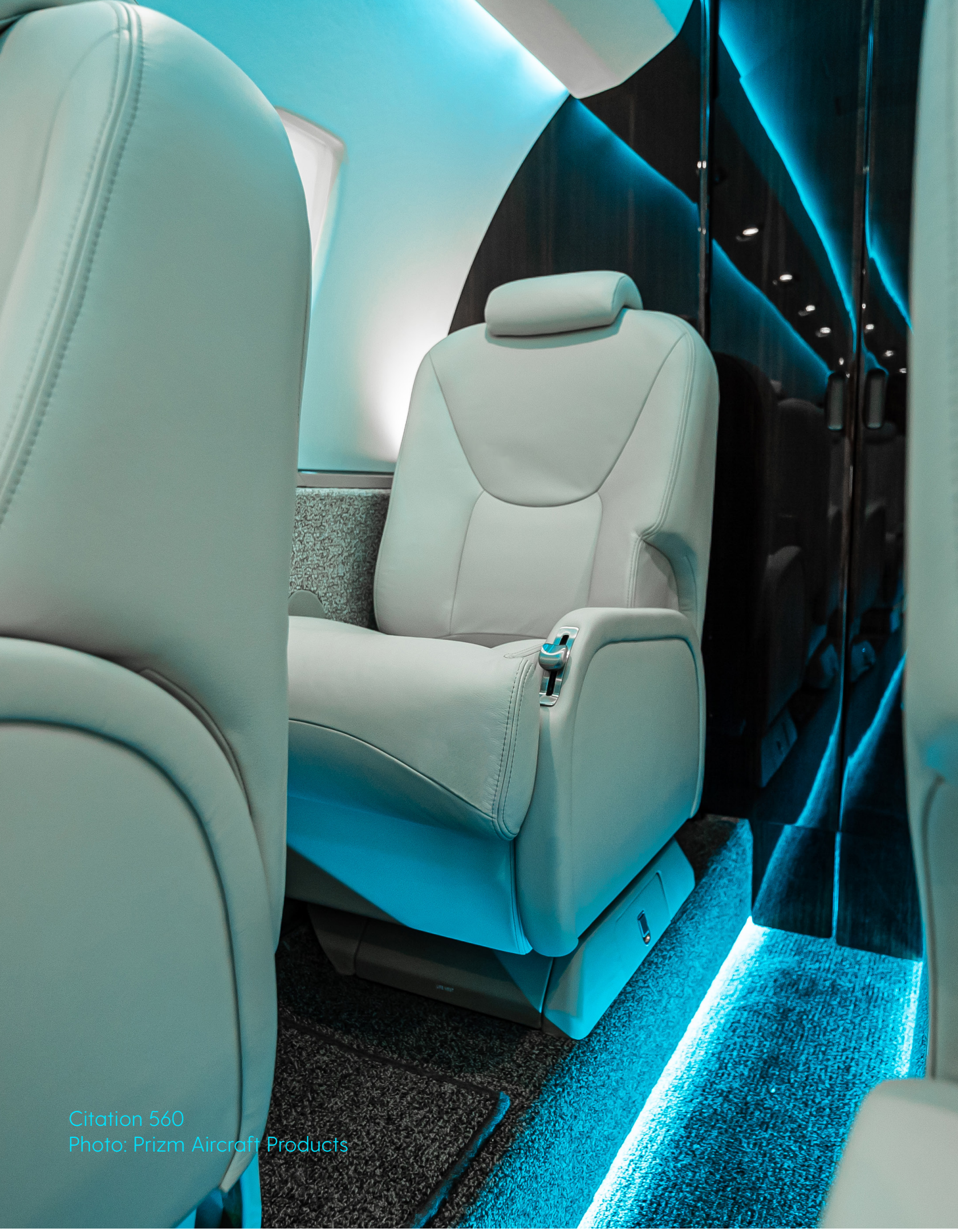
Citation 560